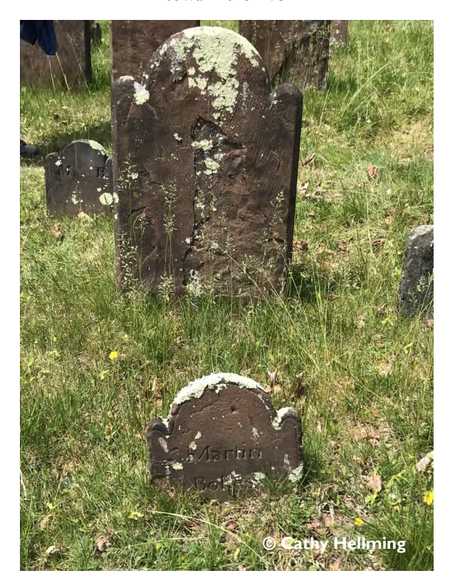
View of both markers for Martin Bolles