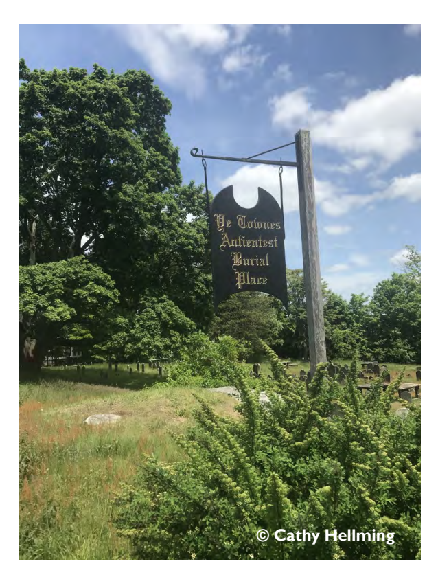
Entrance sign to the cemetery